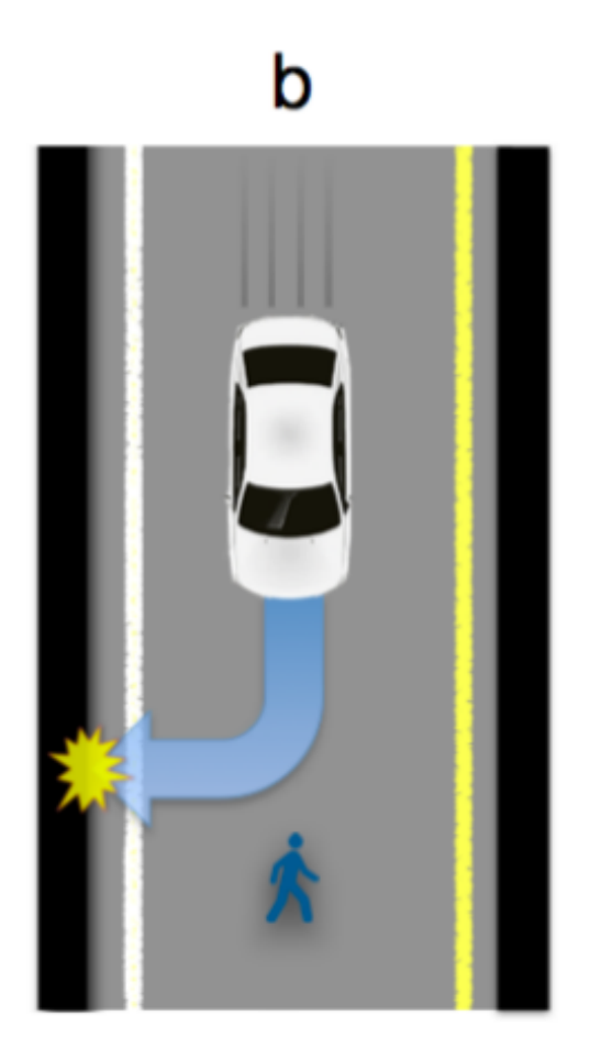
Image: <a href="http://www.businessinsider.com/the-ethical-questions-facing-self-driving-cars-2015-10">http://www.businessinsider.com/the-ethical-questions-facing-self-driving-cars-2015-10</a>